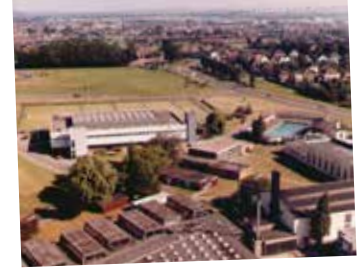
View of outdoor pool 1985